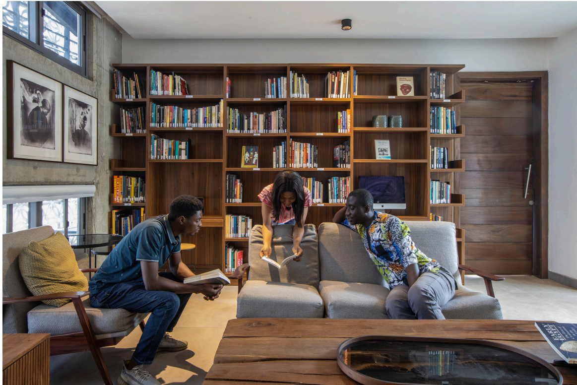
Picton Reference Collection, G.A.S. Foundation Lagos.

The polysemous concept of the assemblage has evolved from archaeological groupings of contemporaneous artefacts to encompassing both the human and non-human, and as a way of thinking about the social world. In the film Reassemblage (1982), Trinh T. Minh-ha introduces a radical repositioning of the assemblage as a cinematic device, exploring African female subjectivity through a chorus of abrupt jump cuts, repetitive voice-overs and close-ups. The film's fragmented images and mismatched field recordings emphasise and embody the technique of "speaking nearby."