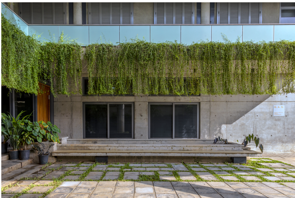
G.A.S. Foundation Lagos.