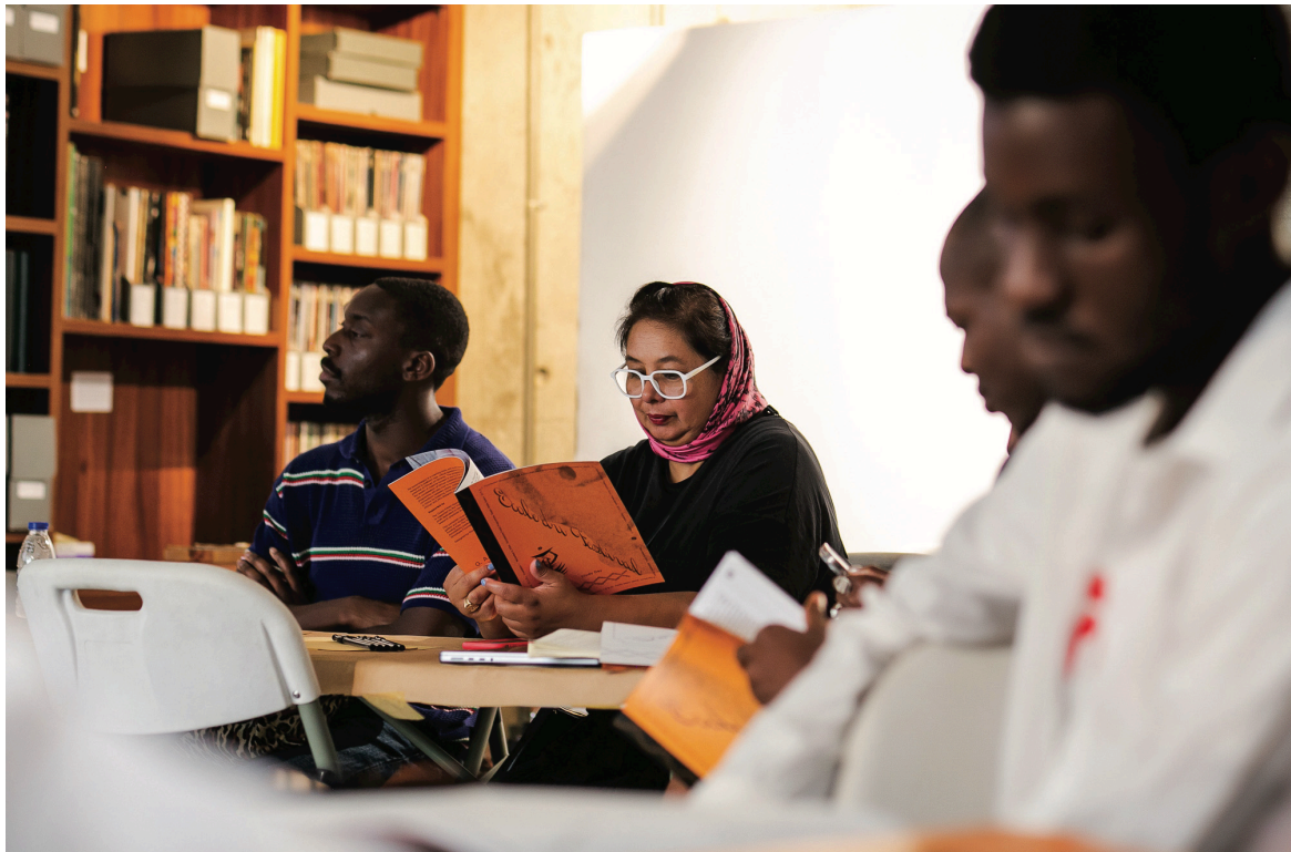
Annotations Study Day: École du Festival.